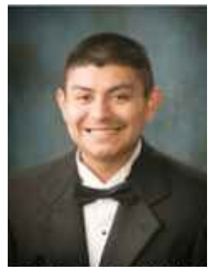
EBER GERMANY NORTHEAST HIGH SCHOOL